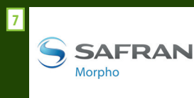
Morpho Cards GmbH (Germany, Flintbek)