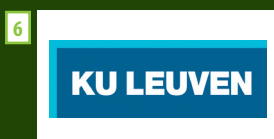
KU Leuven – University of Leuven (Belgium, Leuven)